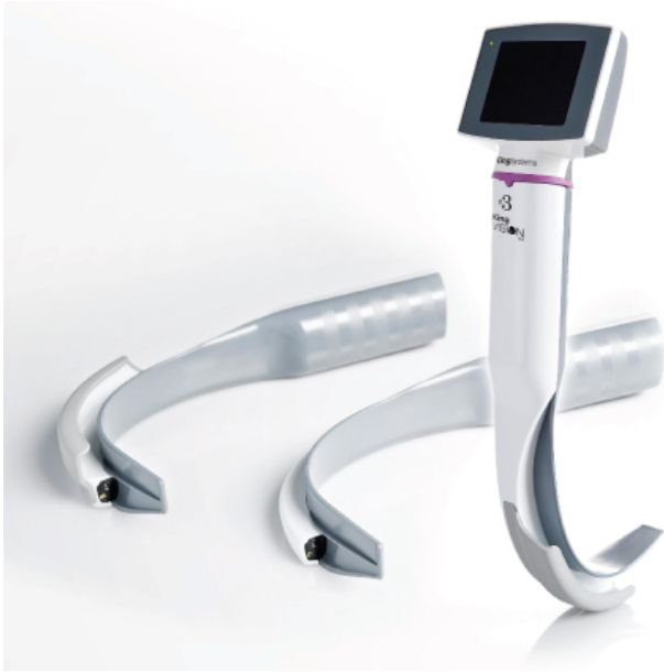
Figure 1. KVL