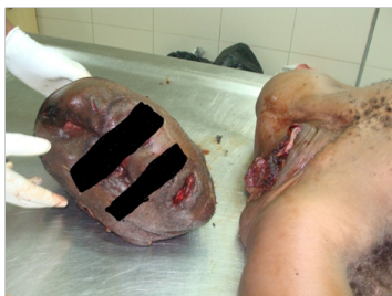
Figure 8. Decapitated Head recovered 10 days after the Crime.