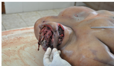
Figure 3. shows the Torso with Three Wedge shaped Tissue Tags in Complete Homicidal Decapitation.