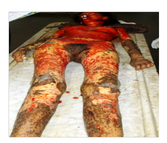
Figure 3. showing patchy involvement of skin with spared areas over legs.