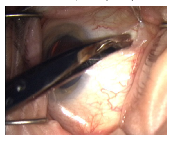
Figure 2. Sub-Tenon's Anaesthesia - freeing the quadrant