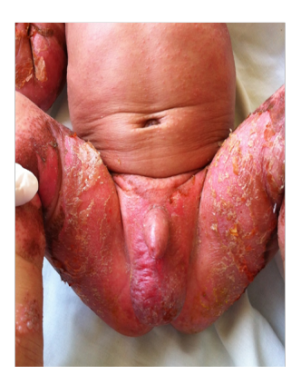
Figure 3. Vulvar Edema in a Crohn's Disease.