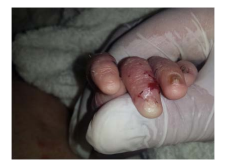
Figure 4. Deformity of the hands.