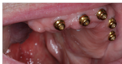
Figure 1b. Reconstruction with obturator prostheses retained with locators following maxillectomy.