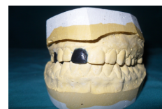
Figure 5. Wax up.

The patient agreed on the treatment plan, which enabled us to begin the pre-prosthetic development phase. For this, we began by resuming the endodontic treatment on the 11 to improve the canal obturation (Figure 6). Subsequently, we began the surgical phase aiming firstly on the biological space on the lingual surface of the 11 (Figure 7), and on the other hand, the alignment of the crown of this tooth with that of the 21 (Figure 8); The objective being to obtain an aesthetic prosthesis and respecting periodontal health.