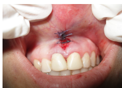
Figure 11. Freinectomie.

Seven days after, the stitches were removed: the condition of the periodontium was stable with good healing (Figure 12). These parameters allowed us to proceed to the realization of the prosthesis itself. For this, we began by reconstructing the fiber 11 (Figure 13).