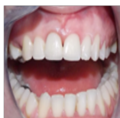
Figure 14. Résultat esthétique final après scellement des couronnes en zircone.

The patient was very satisfied with the final aesthetic outcome.