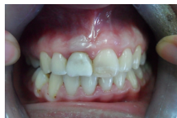
Figure 2. Etat Dentaire Initial.