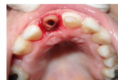
Figure 8. Gingivectomie.