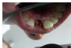
Figure 3. Etat Initial de la 11 après démontage de la prothèse Provisoire.

Radiological examination revealed a defective root canal restoration at the level of the 11 with the presence of a periapical radiolucent image. The root anchorage of the temporary prosthesis was very low in the root. The lingual residual wall was juxta-osseous, which will already compromise the realization of a prosthesis respecting the integrity of the periodontium (violation of the biological space). However, the length and shape of the root were considered favorable for the preservation of the tooth (ratio CR / RR < 1) (Figure 4).