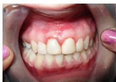
Figure 13. Reconstitution fibrée de la 11.