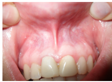
Figure 10. Cicatrisation Après Sept Jours.

At this stage, it was essential to guarantee the stability of the result obtained and to prevent any change in the levels of the crowns by the traction of the upper labial frenum. For this a frenectomy was performed (Figure 11).