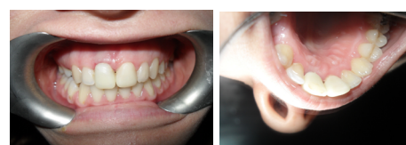
Figure 9a, 9b. Prothèse provisoire (FV et FL).

A first check was made one week after surgery; we noticed a good healing of the gingival contour of the 11, with no inflammation