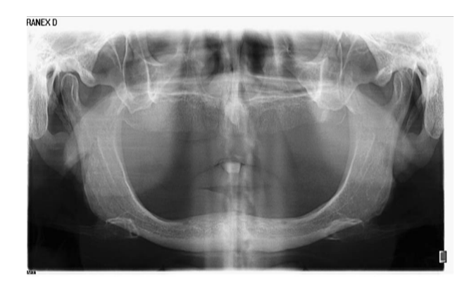
Figure 1. Severe Mandibular Bone Resorption in a 66-years-old Male.