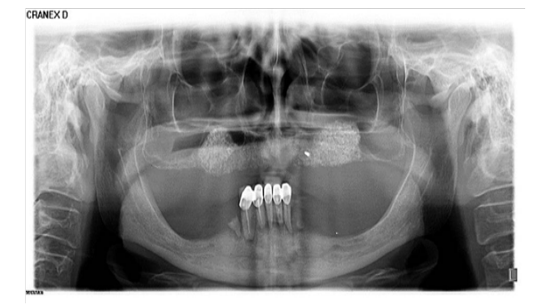
Figure 3. Bilateral Radiopaque Lesion of Maxilla in a 63-years Old Famale.

In a number of studies, the panoramic radiographs of the elderly have been evaluated using quantitative methods, including studies by Joo, Humphries, Sofat and Haster [23-26]. The quantitative evaluations carried out in these studies consisted of changes in the gonial angle and the height of the mandibular bone (vertical resorption) with aging, indexes such as mental index, mandibular cortical index and mandibular index. In some other studies the radiographic evaluations have focused on some special cases. In this context, a study by Mathew evaluated the maxillary sinus findings such as mucous retention cysts on panoramic radiographs of the elderly [27]. N'Guyen evaluated the palate on the radiographs of the elderly [28] and Celia dedicated their specific radiographic evaluation to the prevalence of elongated styloid process in the elderly [29].